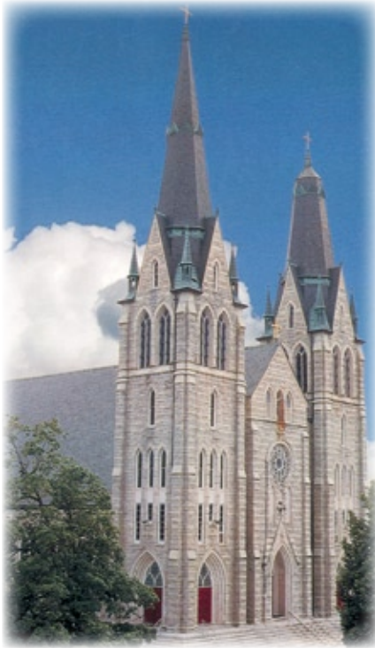
Sacred Heart Church celebrated its 110 th Anniversary.

Sacred Heart Church in New Britain, Connecticut celebrated its 110 th Anniversary on November 7, 2004. The day's events included a bilingual Mass, an historical exhibit in the lower church, a parish reception, and a parish raffle.