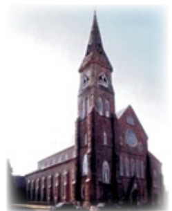
Cathedral of Saint Mary of the Assumption