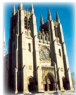
Cathedral of the Most Blessed Sacrament