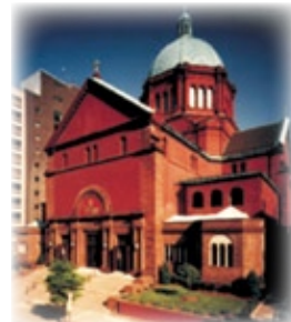
Cathedral of St. Matthew the Apostle